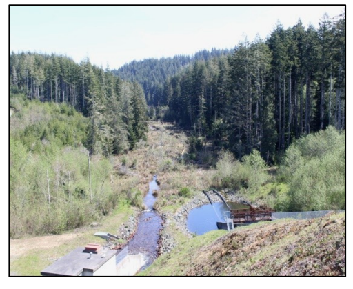
Spillway at Upper Pony Creek

A Source Water Assessment was completed by the Oregon Department of Environmental Quality and the Oregon Department of Health Services to identify the land surface areas (and or subsurface areas) that supply water