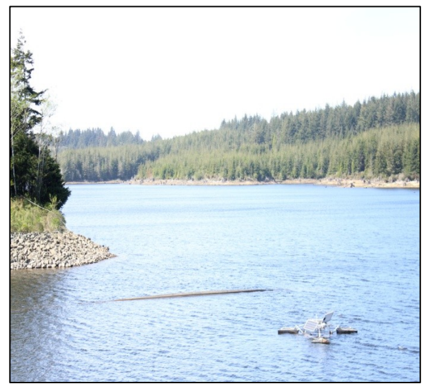
Upper Pony Creek Reservoir

In order to ensure that tap water is safe to drink, EPA prescribes regulations that limit the amount of certain contaminants in water provided by public water systems. Food and Drug Administration (FDA) regulations establish limits for contaminants in bottled water which must provide the same protection for public health.