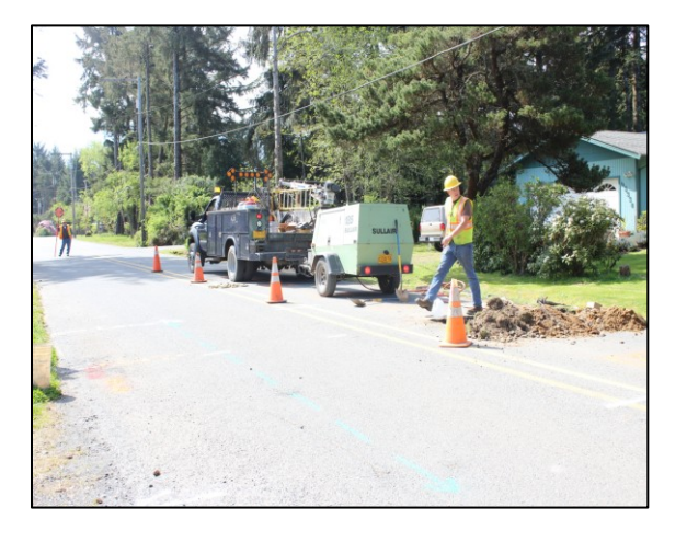
Crew members installing a new service

Visit <u>www.epa.gov/watersense</u> for more information on water conservation.