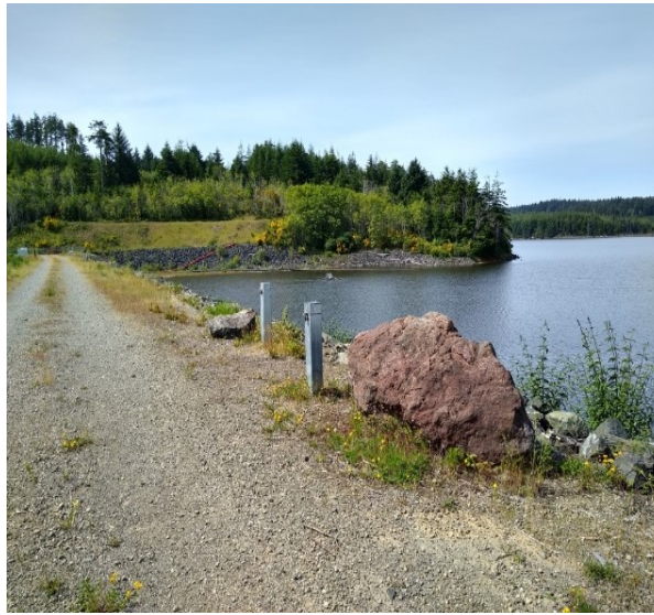
Upper Pony Creek Reservoir

In order to ensure that tap water is safe to drink, EPA prescribes regulations that limit the amount of certain contaminants in water provided by public water systems. Food and Drug Administration (FDA) regulations establish limits for contaminants in bottled water which must provide the same protection for public health.