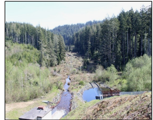
Spillway at Upper Pony Creek

to Coos Bay-North Bend Water Board's Pony Creek system. The study also inventoried the potential contaminant sources that may impact the water supply. The study can be reviewed by those interested at the Coos Bay Public Library, North Bend Public Library, or the Water Board Office.