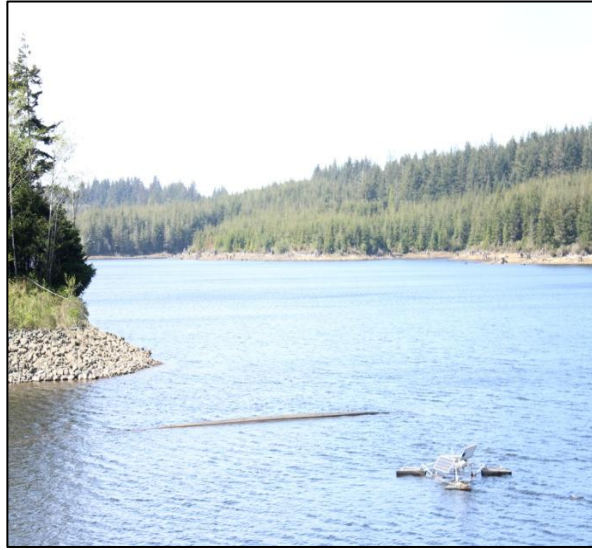
Upper Pony Creek Reservoir

In order to ensure that tap water is safe to drink, EPA prescribes regulations that limit the amount of certain contaminants in water provided by public water systems. Food and Drug Administration (FDA) regulations establish limits for contaminants in bottled water which must provide the same protection for public health.