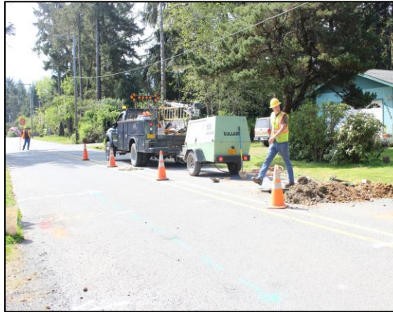
Crew members installing a new service

Visit www.epa.gov/watersense for more information on water conservation.